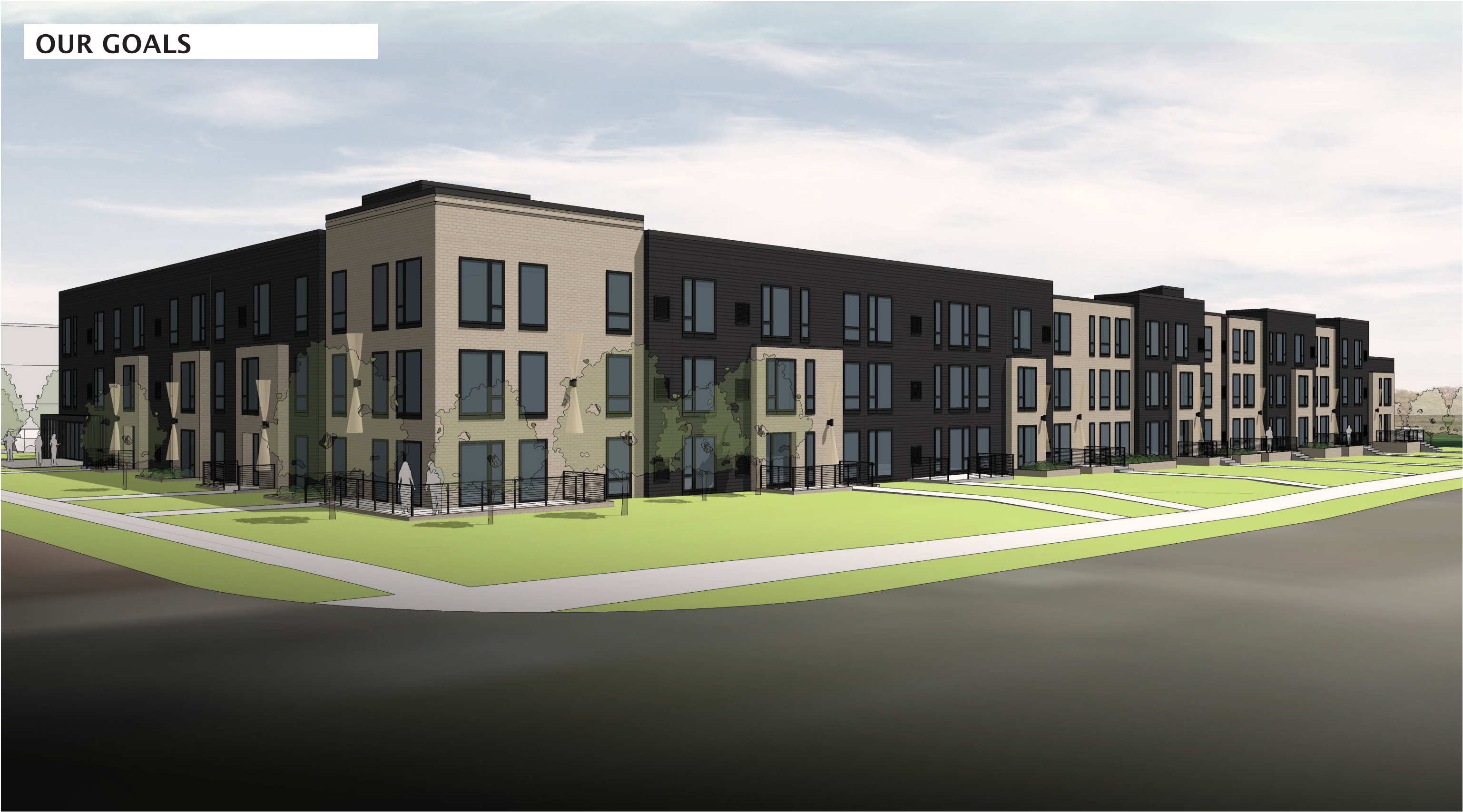
Hillside Heights Apartments