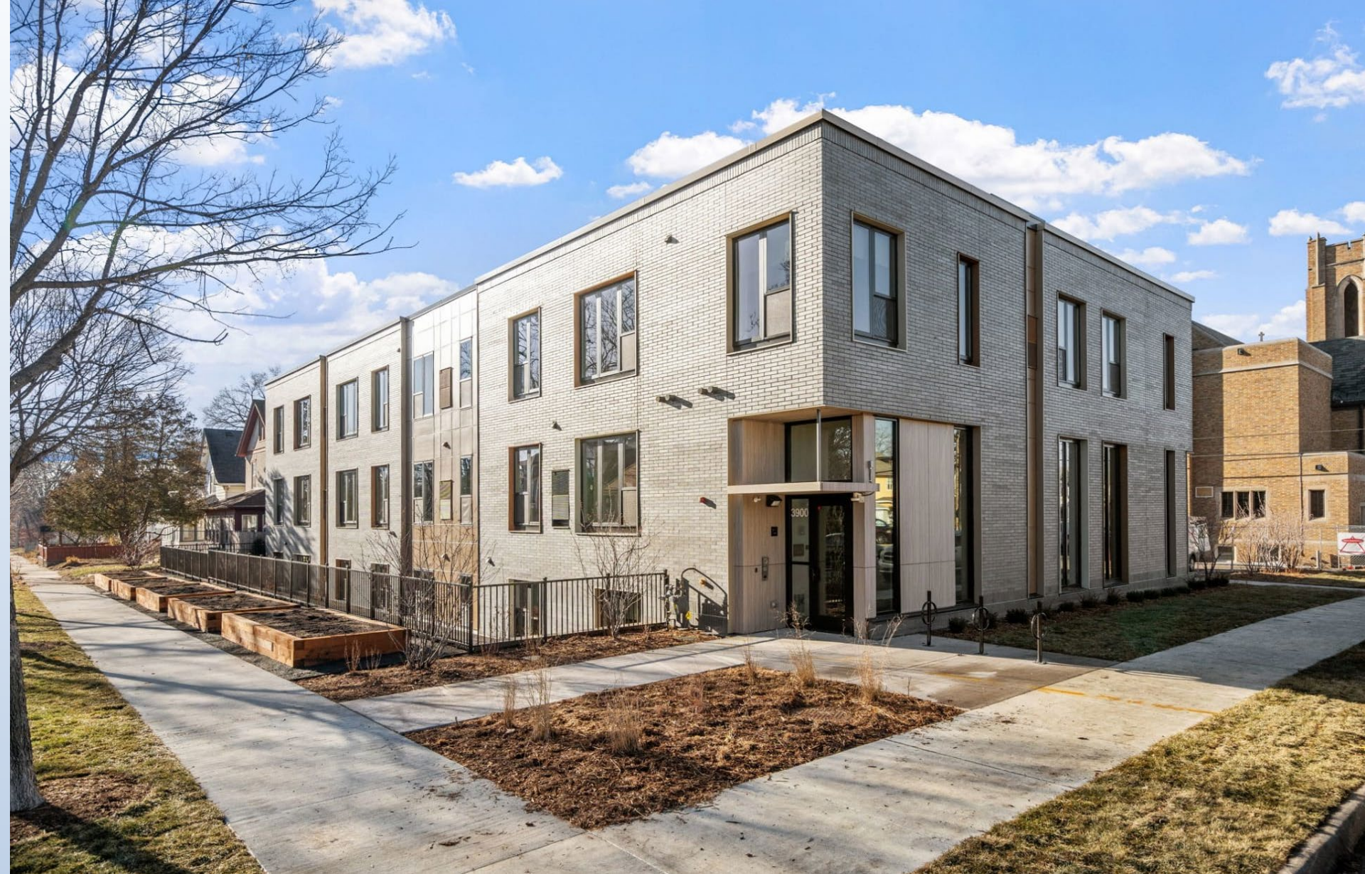
Belfry Apartments – One Block from George Floyd Square