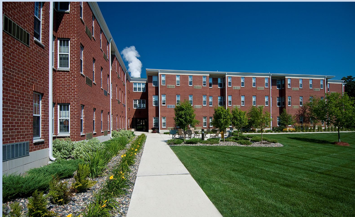
Bloomington, near airport