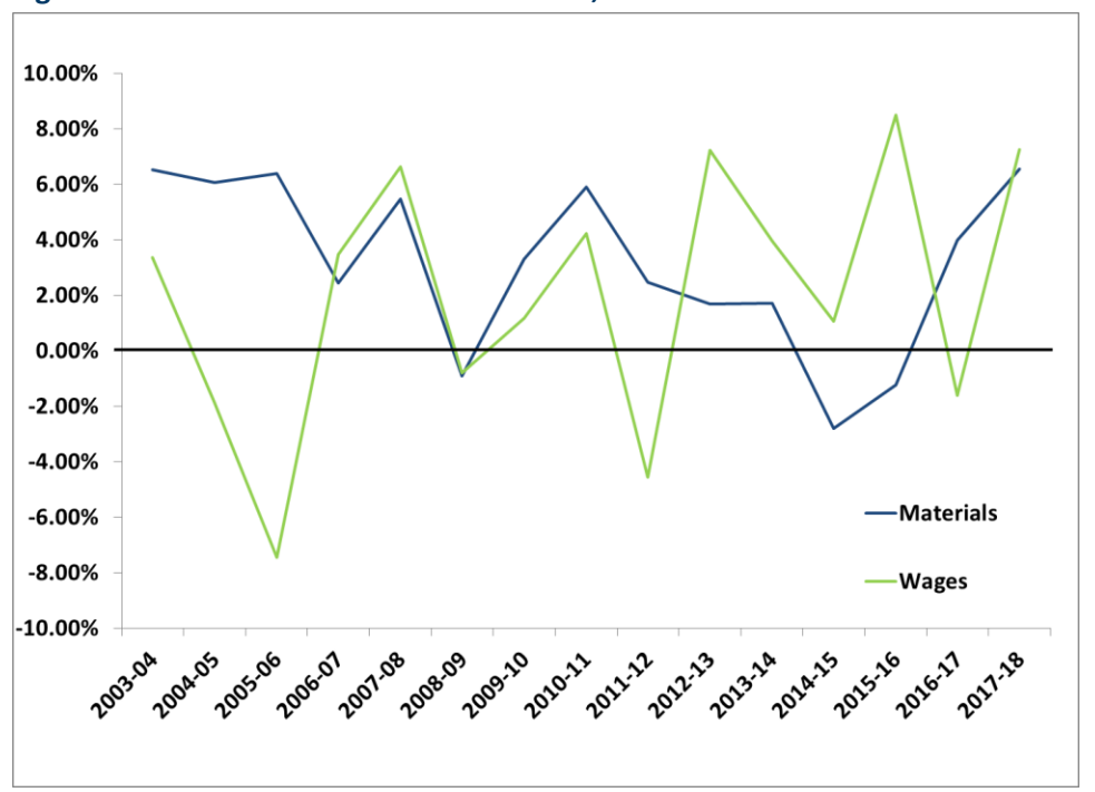
Figure 4: Residential Construction Inflation, 2003 to 2018