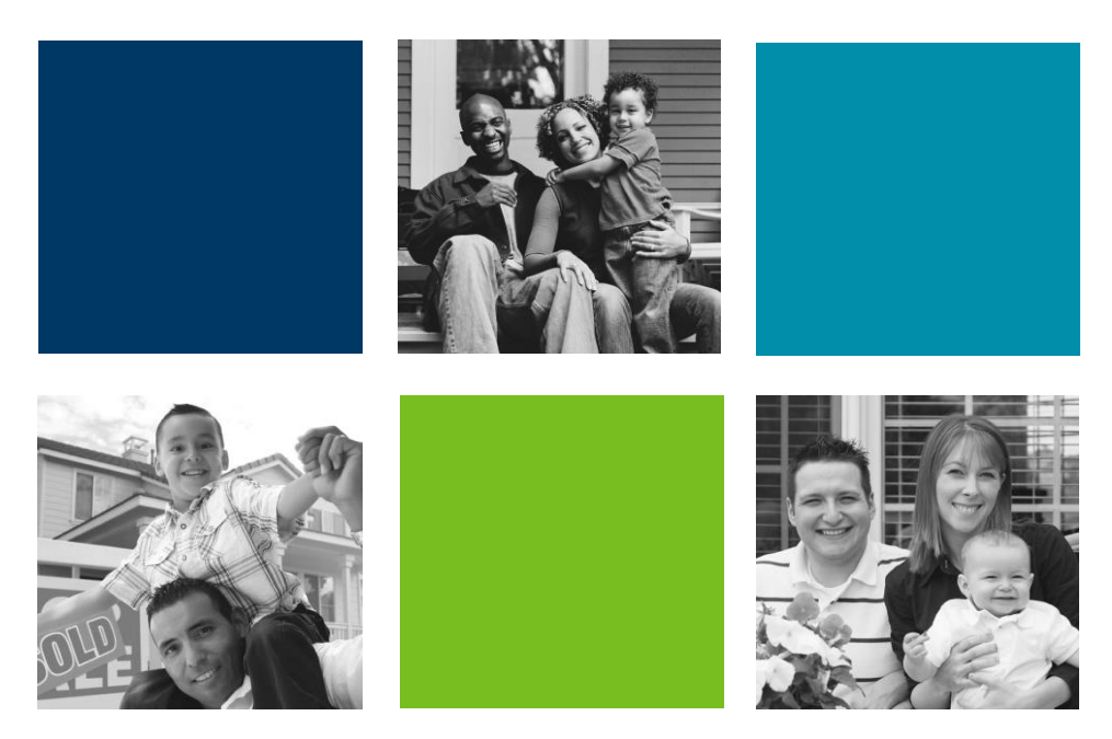
Planning, Research & Evaluation